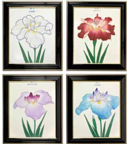
314 (four from a set of twelve)