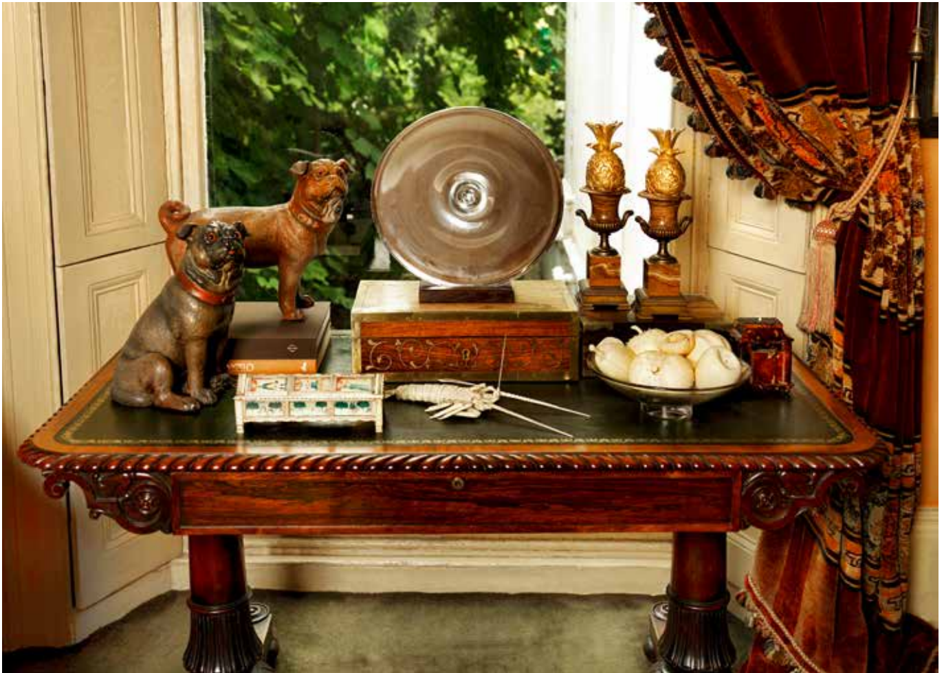
Lots 35, 36, 22 (part), 39 (part), 23 (part), 37 and 34 (part)