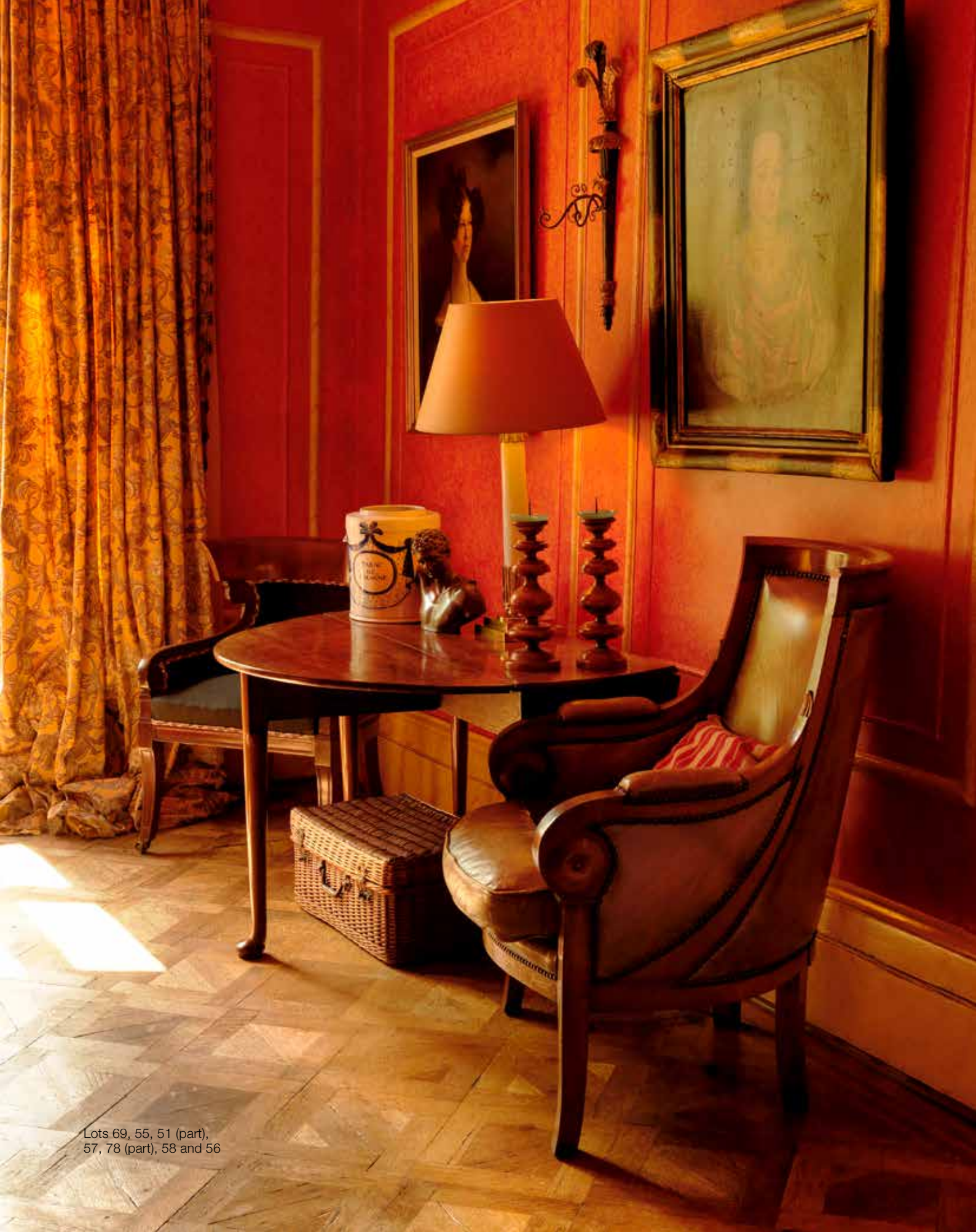
Lots 69, 55, 51 (part), 57, 78 (part), 58 and 56