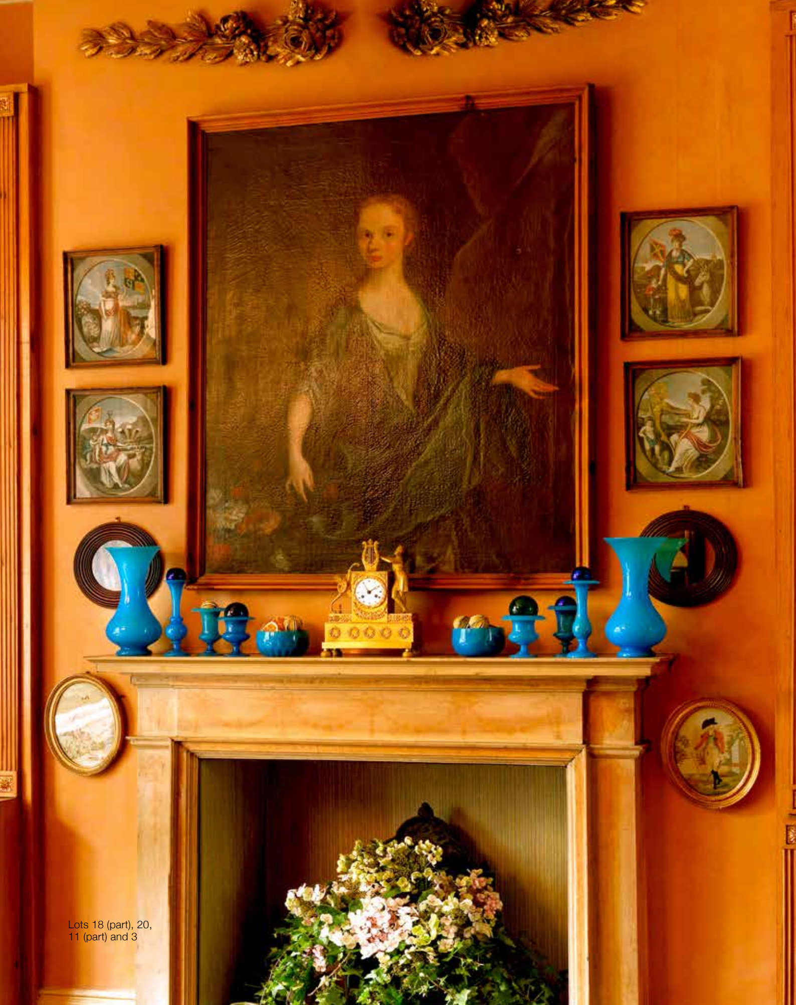
Lots 18 (part), 20, 11 (part) and 3