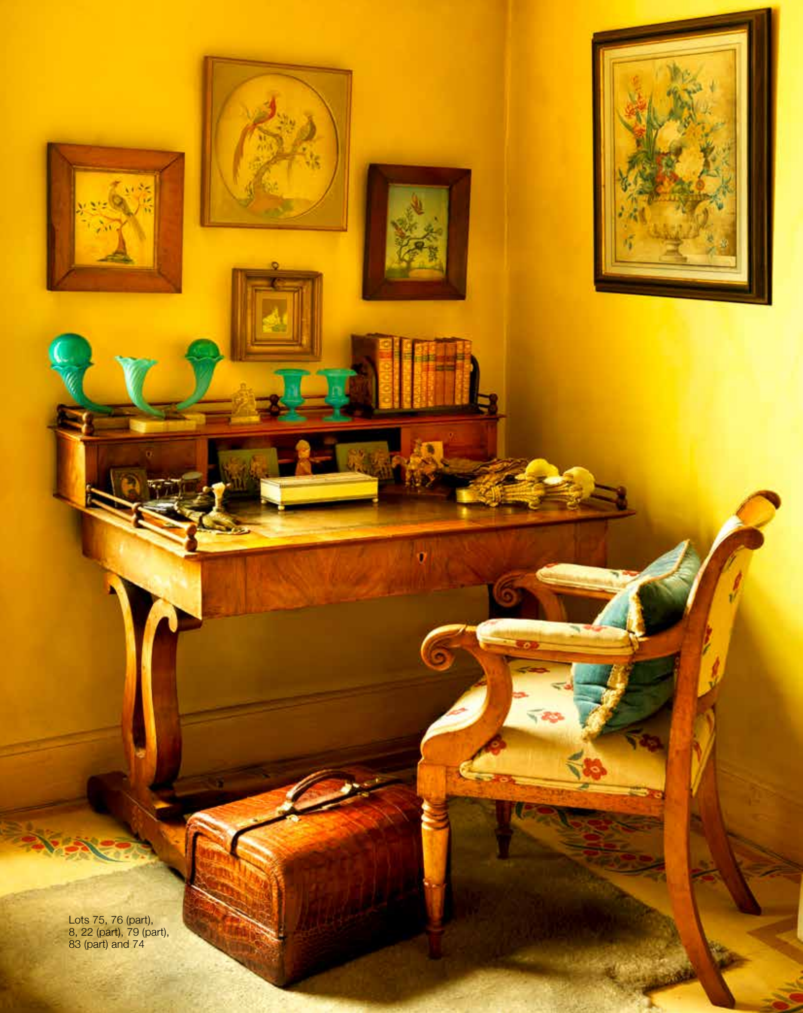
Lots 75, 76 (part), 8, 22 (part), 79 (part), 83 (part) and 74