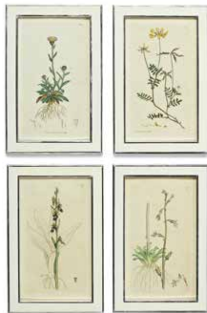
315 (four from a set of forty eight)