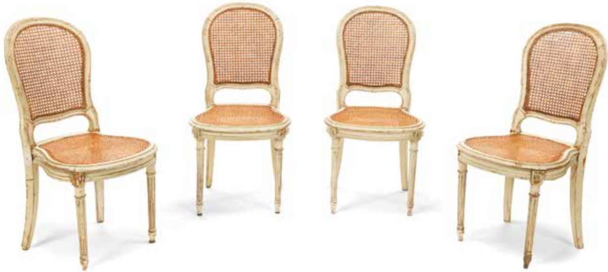
320 (four from a set of twelve)