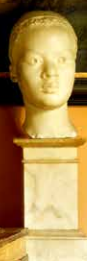
Lots 2, 78 (part), 23 (part), 4 and 7